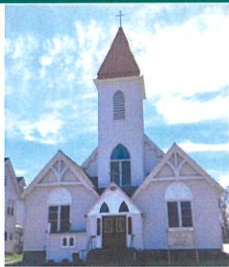
St. Vincent's Site