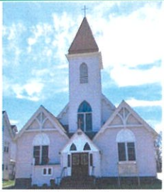
St. Vincent's Site