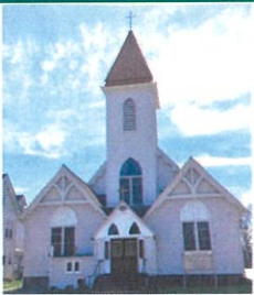
St. Vincent's Site