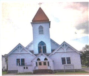
St. Vincent's Site