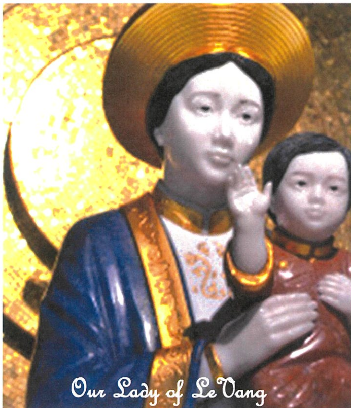
Our Lady of Le Vang