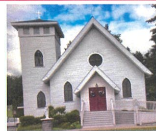
St. Joseph's Site