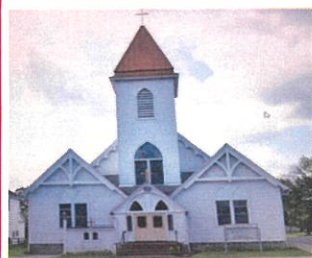
St. Vincent's Site