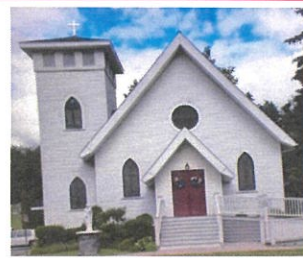
St. Joseph's Site