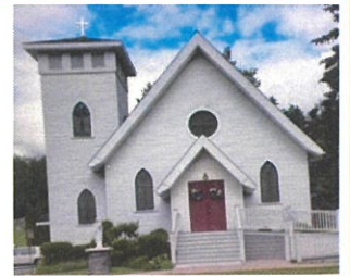
St. Joseph's Site