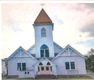
St. Vincent's Site