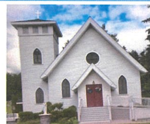
St. Joseph's Site