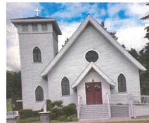
St. Joseph's Site