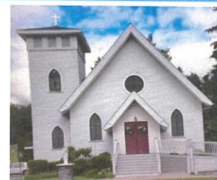
St. Joseph's Site