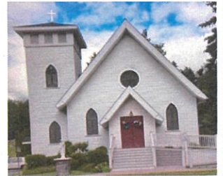
St. Joseph's Site