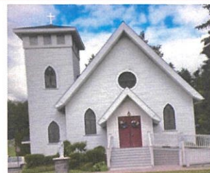
St. Joseph's Site