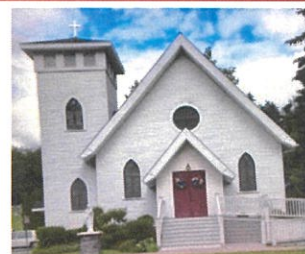
St. Joseph's Site