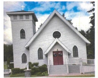
St. Joseph's Site