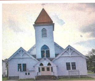
St. Vincent's Site