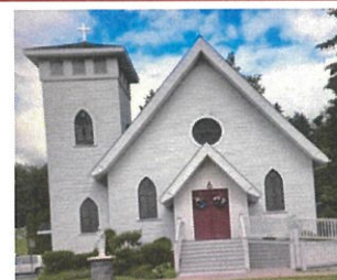
St. Joseph's Site