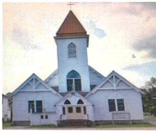
St. Vincent's Site