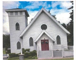
St. Joseph's Site