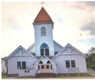
St. Vincent's Site